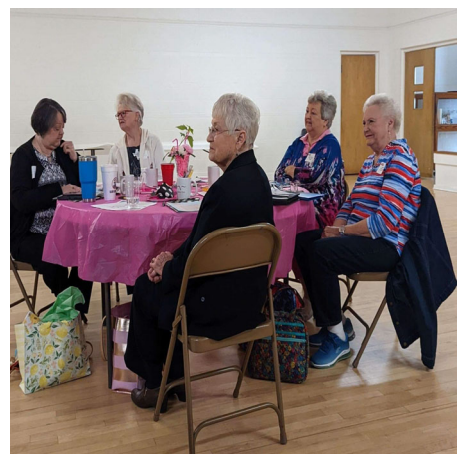
Group of Ladies Enjoying the District 3 Spring Conference