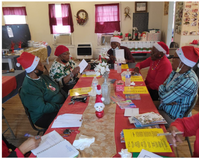
Activities with gift bags in the background