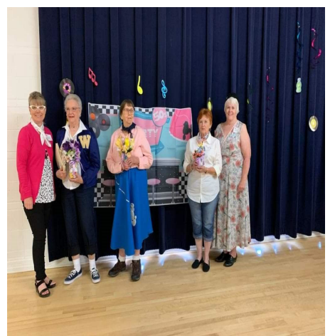
Entire Group at the Style Show