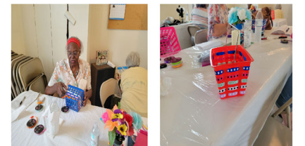
Making Gift Baskets