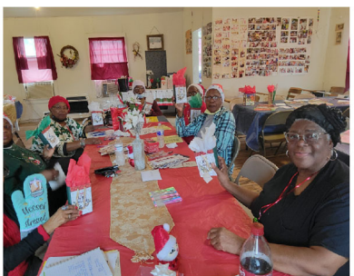
Jewelry Gift Exchange Pic