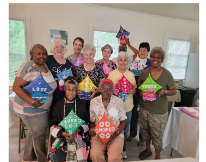
Milam Co. EEA Clubs, Branchville and Rockdale