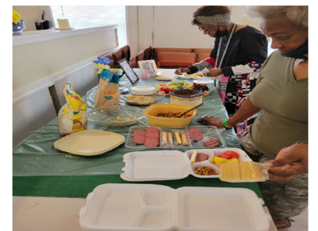
Buffet Style Serving