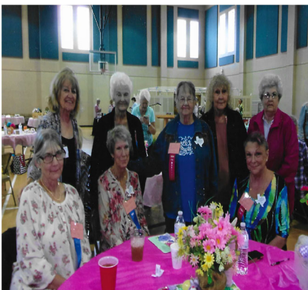
The three clubs attending the District 8 Spring Conference