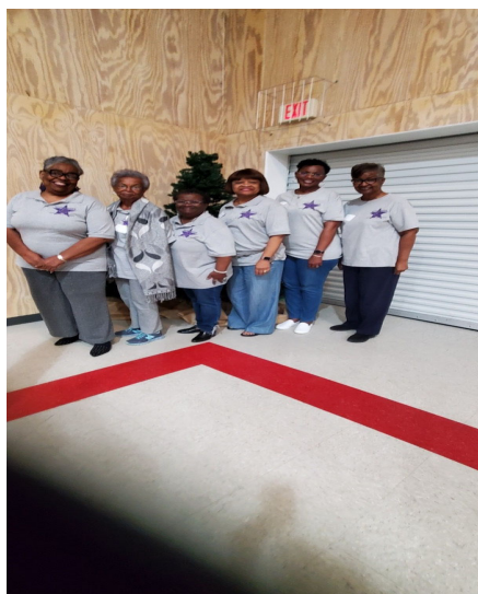
District 9 Meatra EEA members at Spring Conference in Kountze TX