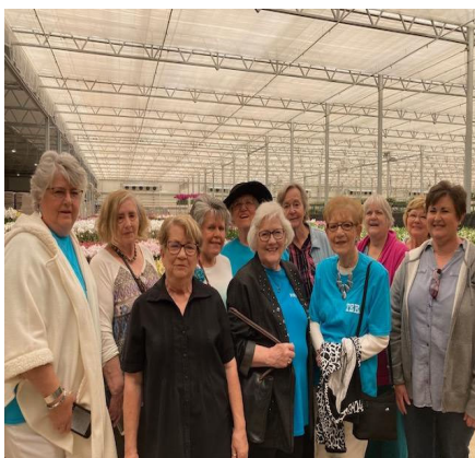
Members and guests of Bowie EEA amid thousands of orchids in Nocona.

Later that month, members toured Color Orchids in Nocona. This Virginia based company opened in 2020 and will triple in size with additional greenhouses soon. The Nocona location ships millions of orchids throughout the Midwest.