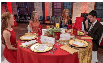
4-H members waiting for their formal evening to begin