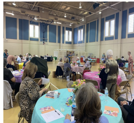
Members enjoying the conference