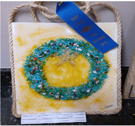
"The Shattered Glass Wreath", 1 st place winner