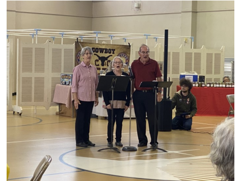
Lake Leon Baptist Church Singers