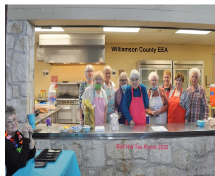
Williamson County EE Members serving in the kitchen at Quilt Show