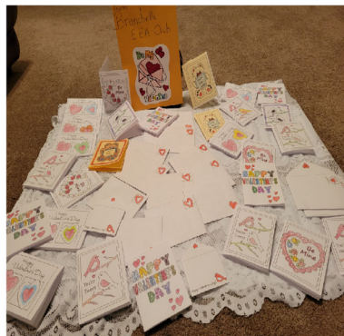
Valentine's cards for Residents at Cameron's Nursing Facility