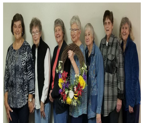
Southern Belles with Spring Wreath