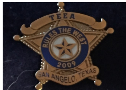
2009 San Angelo