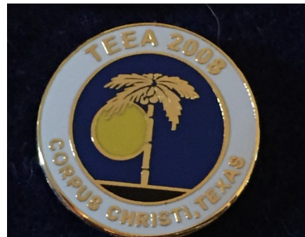
2006 Corpus Christi