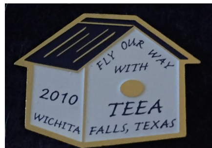
2010 Wichita Falls