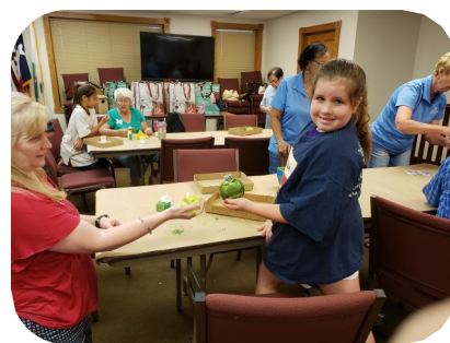
Kids making Grinch ornament