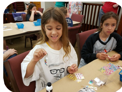
Kids making Domino Necklace/Keychain