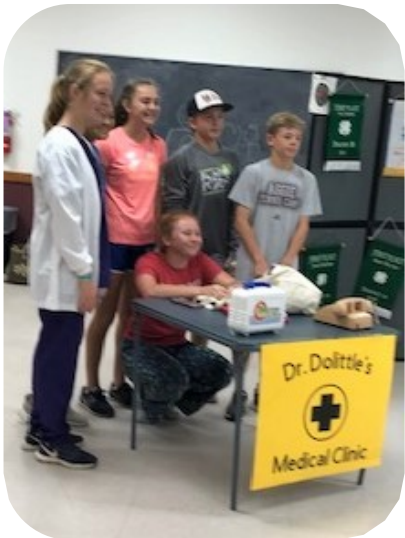
Dr. Dolittle's Clinic

The EE members enjoyed the 4-H members performances and were proud to see young people do so well.