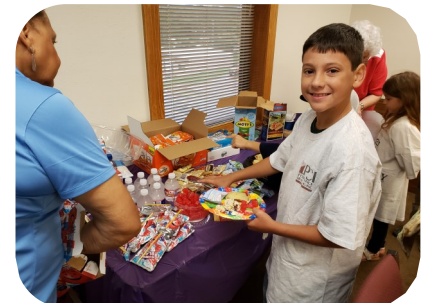
Leon EE members helping serve snacks to Kid's Camp participants

"Never forget where you've been. Never lose sight of where you're going. And never take for granted the people who travel the journey with you."