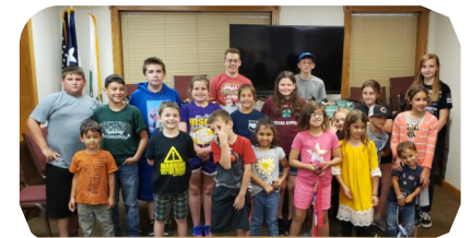
Kid's Camp attendees