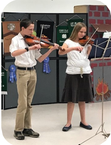
Violin duo – Danny Boy