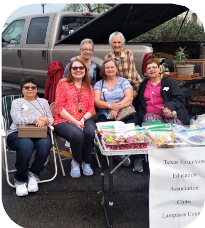
Lake Victor's annual invitation turned out to be the most fun ever on April 25. Their theme

Bloomin' Fest was held April 6 on the square in downtown Lampasas. It is our annual fundraiser and form of recruitment. The day started off with two squall lines of heavy rain, so we didn't set up until noon. It turned out okay with some sun later on.