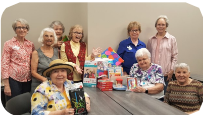
Shown in the photo are members of the Noontime EE Club in Williamson County.

Noontime EE Club Members, Williamson County, gather around the Birthday Box they filled recently. Each one brought items needed to provide a fabulous birthday party for a teen boy in foster care. This Community Project was in partnership with a local non-profit, Birthday Boxes, which provides a birthday box for every child in foster care in the greater Williamson County area. Noontime chose to fill a box for a teen boy because the need is great and the resources are not. The items were included for a party for 10-12 party attendees. Items included cake mix and icing, candles, cupcake liners, sprinkles, party themed napkins, plates, and tablecloth, party decorations, blowers or additional party supplies, Skittles, drinks, and $25 WalMart gift card. The box's theme was balloons, and all club members signed the handmade birthday card. When the box was delivered, the coordinator was so excited that Noontime had chosen to meet this great need. What a fun project!