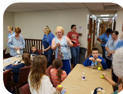
Kid's Camp participants making Dog Chew Toy