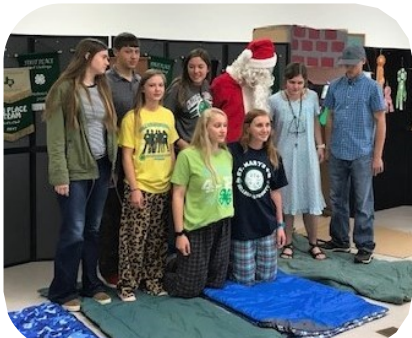
Twas the Night Before a 4-H Competition