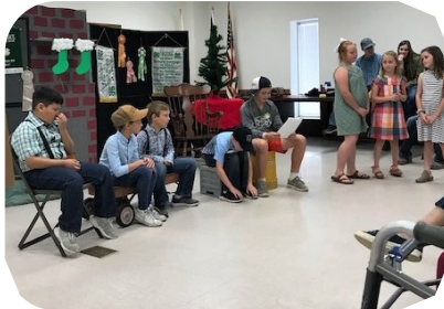
The Little Rascals