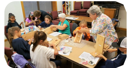
Kid's Camp participants making a Wooden Bird House