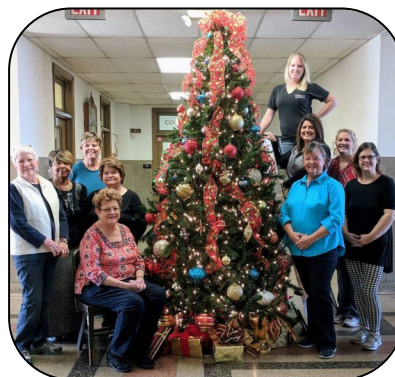
2017 Christmas Tree Team work at the Upshur County Court House