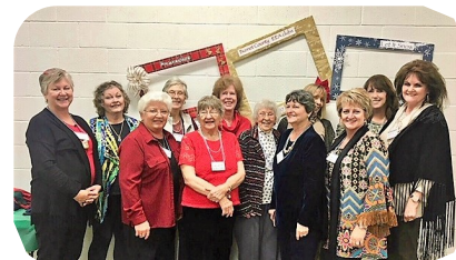
Redbud-Oakalla EE Club