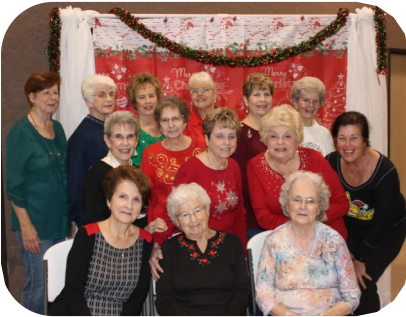
Port Neches Club Members

given a Walmart gift card, all totaling over $600.00. Lunch was provided by the club and members with a total of 38 in attendance. Then it was "Merry Christmas to All" until next year.