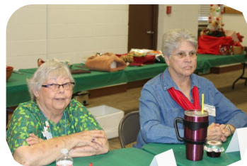
Oatmeal EE Club members