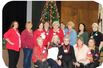
Marble Falls EE Club

was wonderful, a delicious buffet of turkey, dressing, and all the trimmings, a silent auction, and lots of visiting were enjoyed by all attendees. Thank you Marble Falls for a wonderful day.