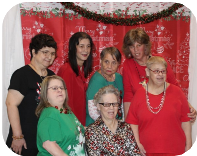
Fedder's Center Clients