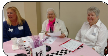
Members having a good time!