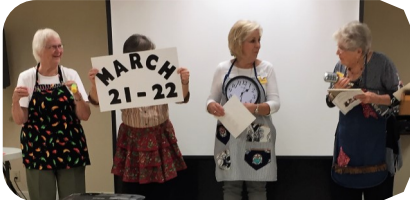
Coleman members issue an invitation to the Spring Retreat and Business Meeting

of the event is "Spring Has Sprung," so put on your apron (homemade) and come and have some fun. They are busy planning some interesting programs and things for members to do. Also, don't forget the District 7 Culture Arts competition, so be sure to get your first and second place winners there.