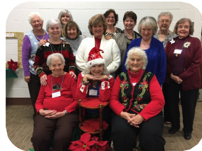
Bethel EE Club