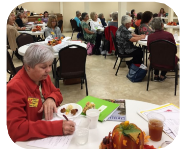
Members enjoying the District 7 Training

District 7 Fall Training meeting was held on November 15 in Lampasas. There were 47 members from eight counties in District 7 attending. Everyone had a wonderful day and thank you Lampasas, for all the hard work.