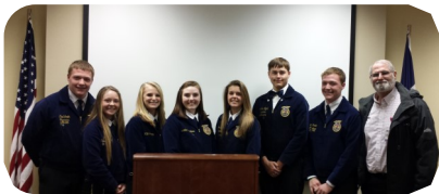
Lampasas FFA Parliamentary Procedure Team and Advisor