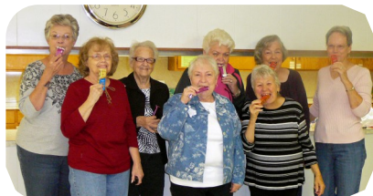
Noontime members sampling the goodies.

Yum! Yum! Noontime EE Club Members recently donated 70 breakfast bars and snack crackers to the Georgetown Backpack Buddy Program. Food is being sent home on Fridays to all the children on free and reduced lunch in all the elementary schools and three middle schools in Georgetown. These children are at risk for not having food enough to eat at home on the weekends. Teachers report that now children arrive back at school on Monday mornings more alert and ready to learn.