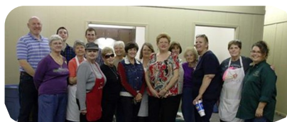
February 2015 - Upshur County - Glenwood TEEA Members Visit the Gilmer Care Nursing Home with a "HAPPY VALENTINES DAY PARTY"