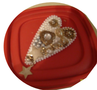
Sample "Memory Pin" members made.