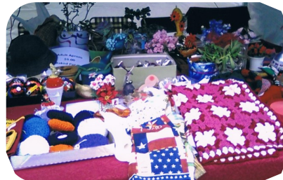
Caldwell & Lockhart fundraiser.

One of our delegates from the State Conference shared a program with each of our clubs. The topic was "To Toss or Not to Toss". This program was a follow up of last year's "Important Papers". It was a very important program and of interest to all who attended.