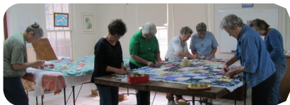
Members tying the quilts