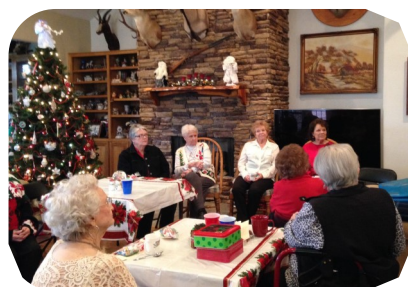
Members enjoying entertainment

Members discussed the "Lunch and Learn" program and voted to continue this community educational program. A different educational program will be presented quarterly with a free lunch provided by the EEC members. Look for announcements in the local newspaper and plan on attending.