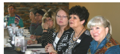
Participants listening to the presentations.