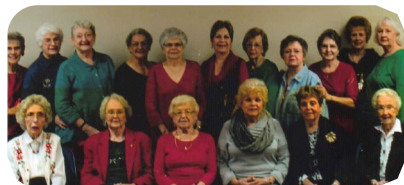
Port Neches B.B. Club members