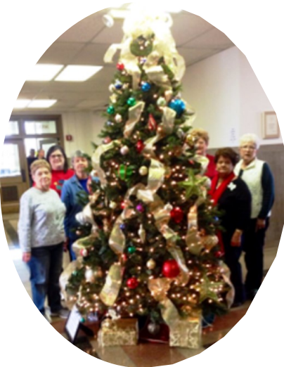
2014 Christmas Tree @ Upshur County Courthouse Donated/Decorated by Glenwood and Southern Belles

..... A true friend overlooks your thorns to admire your flowers.