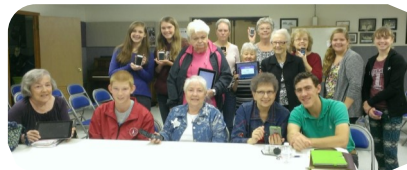
EEC members and Tech Wizards.

The AARP Mentor Up 4-H Tech Wizards met with Noontime EE Club at their November meeting. Shown are the Noontime members and 4-H'ers holding their electronic devices on which they were learning new ways to use them. These 4-Hers also presented this educational program at the 2014 TEEA State Meeting. It was a fun learning experience for everyone. Noontime members were all excited about learning new applications, and the 4-H'ers were very glad to share their knowledge. Thanks, Tech Wizards!