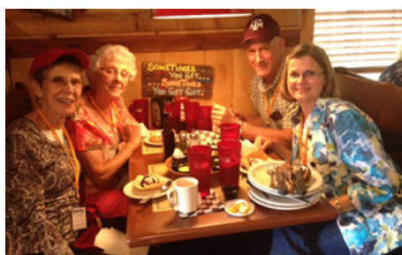
At the Santa Fe Cattle Steakhouse in Nashville, TN