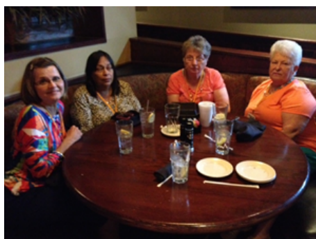
At the Chop House Restaurant in Seville, TN