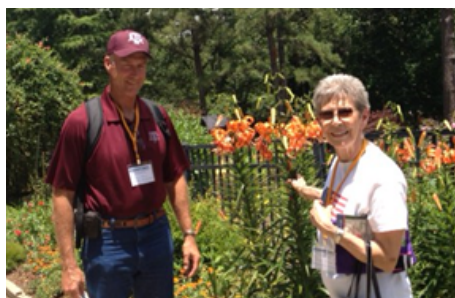
At the Tyler Rose Garden.