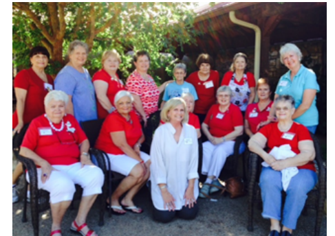
Fifteen members from Williamson County EEA clubs, District 8, attended the summer retreat in August at River Bend Camp in Glen Rose. Williamson County was responsible for leading the crafts activities, with assistance from Bell and Hamilton Counties.