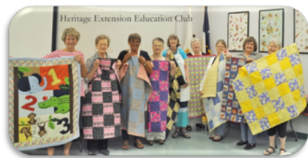
The Raffle quilt, which is a 4-H Scholarship fundraiser, was also given away at our luncheon. One lucky lady from Austin's name was

We also got to display the Linus Quilts that Heritage Club made during the summer. We donated 40 beautiful children's quilts to the Linus Connection. Our workdays were attended by members and some guests who enjoy quilting and they were a big help and all the hours spent on this project is so worthwhile.